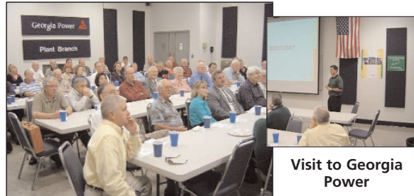
Visit to Georgia Power