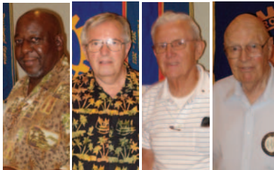
Perfect Attendance Recipients