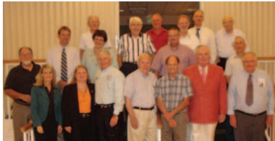
Paul Harris Fellows