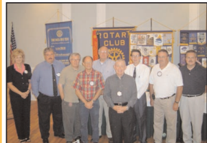
The Milledgeville Rotary Club Board of Directors '04-'05