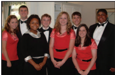
Two vocal ensembles from Georgia Military College provided choral music for the Club's enjoyment.