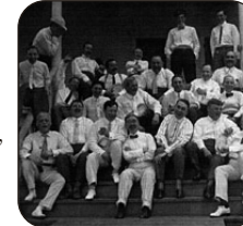
Chicago club members kick back at a weekend retreat at Paw Paw Lake in Michigan, USA, July 1910.

"The Rotary One archives are fantastic," says Kenamore. "The files contain early correspondence of Paul Harris and other leaders of Rotary. They have a tremendous amount of material."