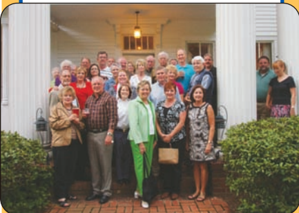
We had a wonderful Rotary presence of 21 Rotarians with 22 family members at the Antebellum Inn for dinner on the opening night of the Milledgeville Players production of "Annie Get Your Gun." The evening was great fun!