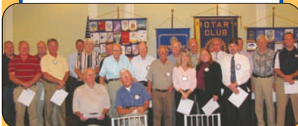
Members with Perfect Attendance were recognized.