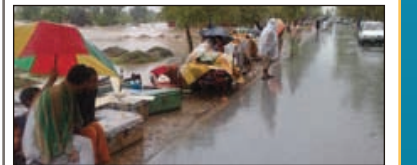
Volunteers hand out food and other aid to victims of the flooding in Pakistan. Bottom: Pakistanis living on the side of the road after heavy flooding.