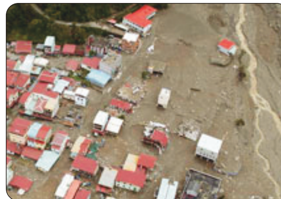
An area in southern Taiwan affected by mudslides after Typhoon Morakot.

Districts in Taiwan are coordinating relief efforts after Typhoon Morakot triggered massive mudslides and flooding August 7-9, killing an estimated 500 people and causing US$1.5 billion in damage.